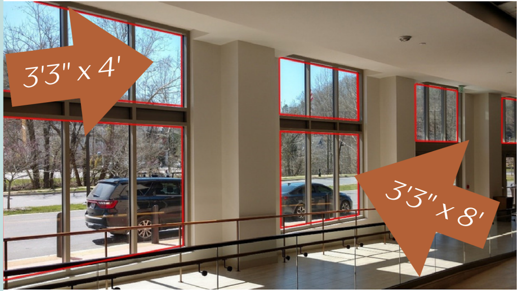
Exhibit Hall Stairway Doors

2 small window sponsorships available $2,500