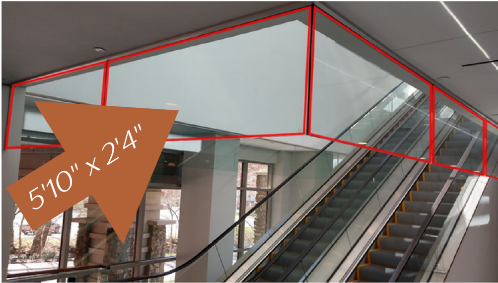
Lobby Escalator Hanging Glass 10 sponsorships available $1,200