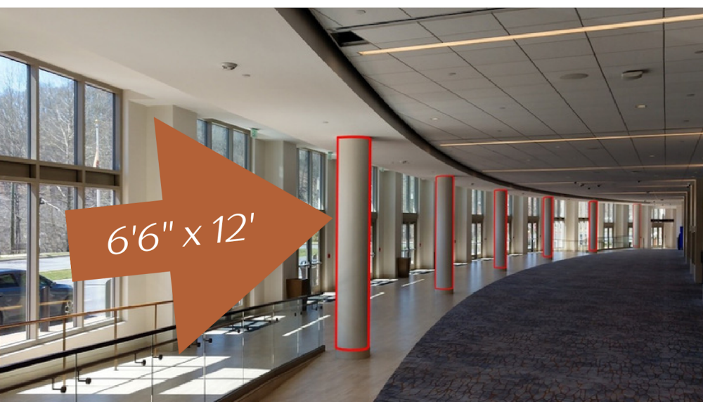
Exhibit Hall Column Wrap 7 sponsorships are available $2,500