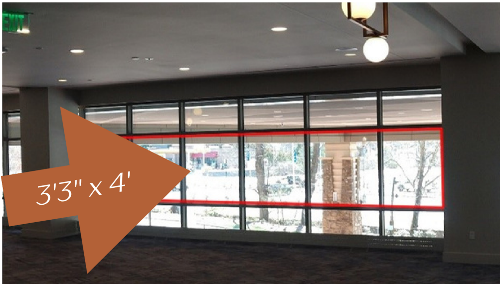
Second Floor Windows 2 sponsorships available $5,000

Be sure that your logo is front and center throughout the conference with different opportunities- pick the one best suited for your company!